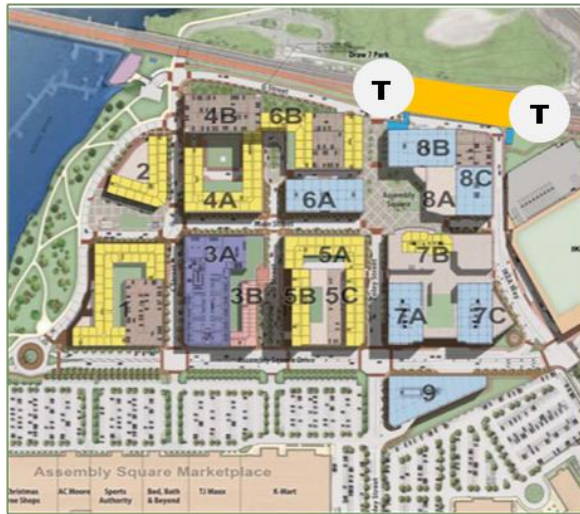
Figure 2: Examples of Dense, Mixed-Use Development