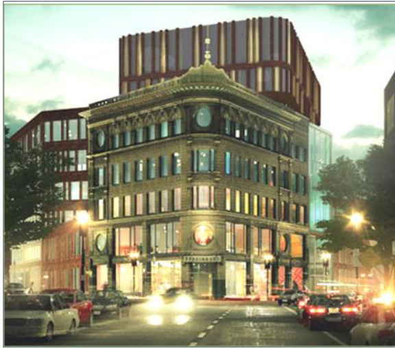
Figure 3: Examples of Equitable TOD