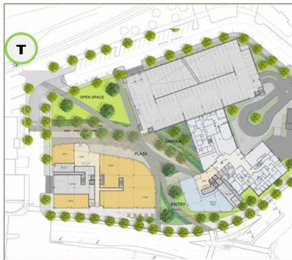
Figure 4: Examples of TOD Supportive Public Realm